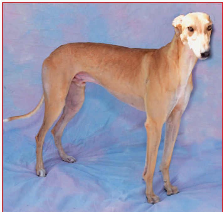
2016 $20,000 BOB BALFE PUPPY STAKES CHAMPION FLYING RUSSIAN