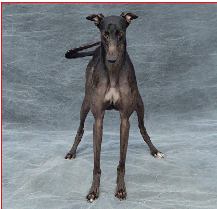
2015 $20,000 BOB BALFE PUPPY STAKES CHAMPION ATASCOCITA CLO